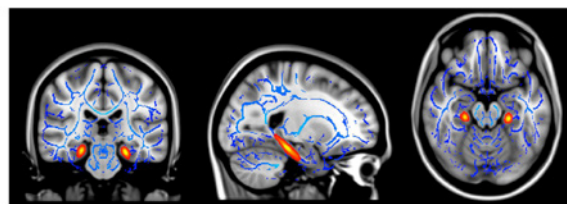
Figure 2: Lower measures of WM integrity in bilateral hippocampal cingulum bundle fibers in mobile phone dependent subjects compared with controls. Regions highlighted in yellow/orange indicate significantly less Fractional Anisotropy and Axial Diffusivity measures of WM integrity of cingulum bundle fibers in the hippocampus of subjects classified as mobile phone dependent. (Wang, Zou, Song et al. 2016)

As SDD are increasingly associated with structural and functional differences, particularly in prefrontal regions involved in impulse control, a key aspect of addiction, recent research by Cai et al. (2016) sheds light on the lesser-known relationship between striatal nuclei volumes, SDD, and impaired impulse control. Compared to healthy controls, IGD adolescents/young adults exhibited greater volumes of the right caudate and nucleus accumbens which were in turn both associated with reduced cognitive control and more severe internet addiction scores respectively [60]. Similar research on frontostriatal circuits and IGD has found a greater volume of right caudate and nucleus accumbens as well as